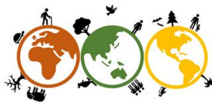
The only planet we have.