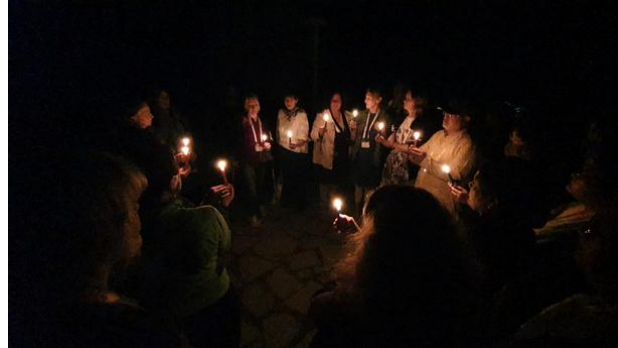
Ewa's memorial service during SICOGA 2022.

Ewa's story has been told while some photos were presented. Then we made a big circle out in the garden, held candles and sang a memorial song in Ewa's memory.