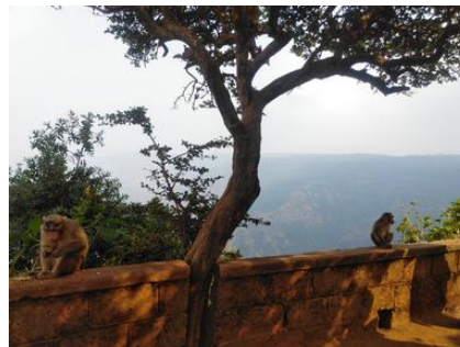
Thieves ready to action.