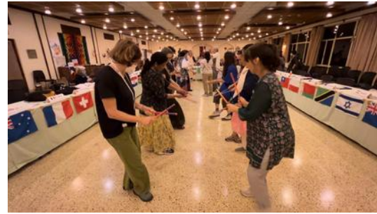
Page of the elections.