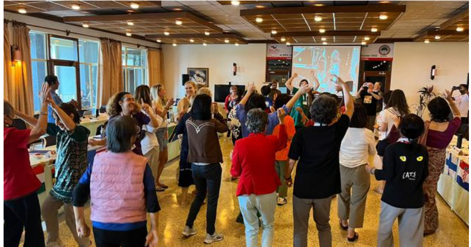
Flash-mob of all the women of SICOGA 2022. United we stand to eliminate violence against women.