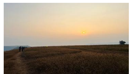
Asia Plateau at sunrise.