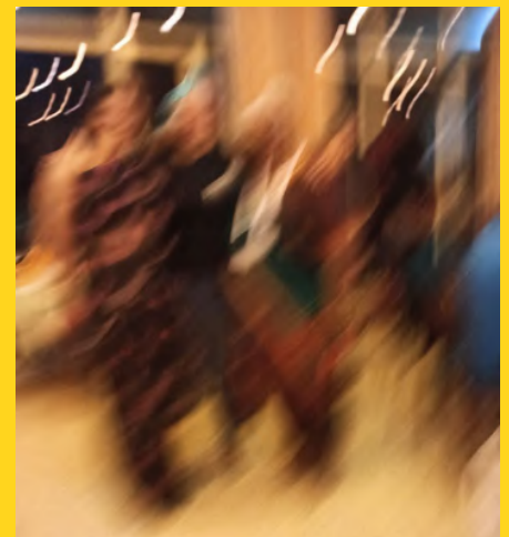
We couldn't help ourselves to insert something less serious. Guess who they are! Leave a note in room 606 Credits - even though maybe this picture is not a real credit - Elena OB.

For more details check the minutes that will be uploaded in: servas.org/en/sicoga2022/general-assembly