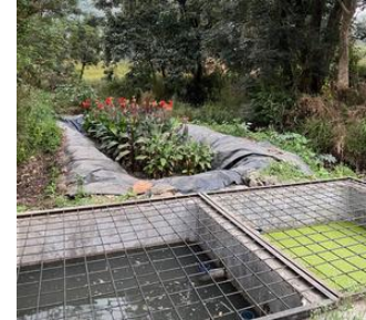
Top: visitors and typical food. Bottom: the sanitation pond.