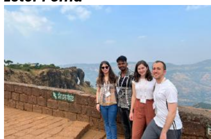
Part of the youth group in Mahabaleshwar