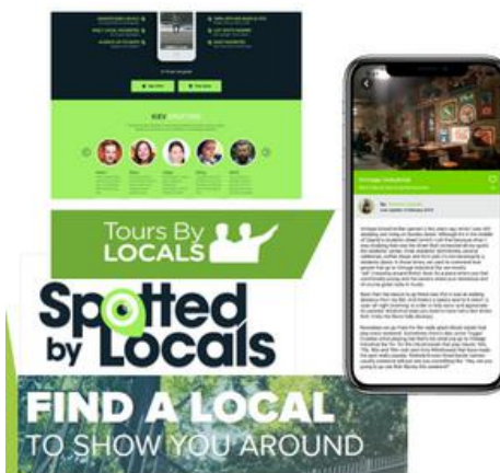
Recommendations from the Belgian report for travelling like locals

created some videos to help understanding the previous version, but still people had troubles managing the technology and the sections that had not been translated. The new version brings a new and greater challenge: are we ready to create a more modern Servas according to technology times?