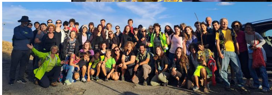
fCollection of pictures from the Servas Summer camp in Sicily, August 2022