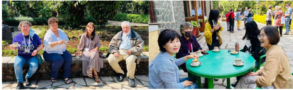
Tea time in the Asia Plateau gardens