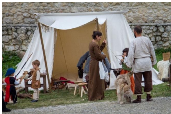
Part of our team!

Rules for participants: Every participant needs to come with a "piece" of his country history (costumes, habits, food, traditions, crafts) for sharing with the others. We have 14 medieval tents available inside the fortress and 15 double rooms in the pensions around.