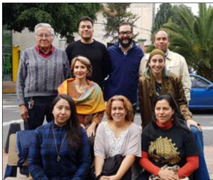
The Servas Mexico national board