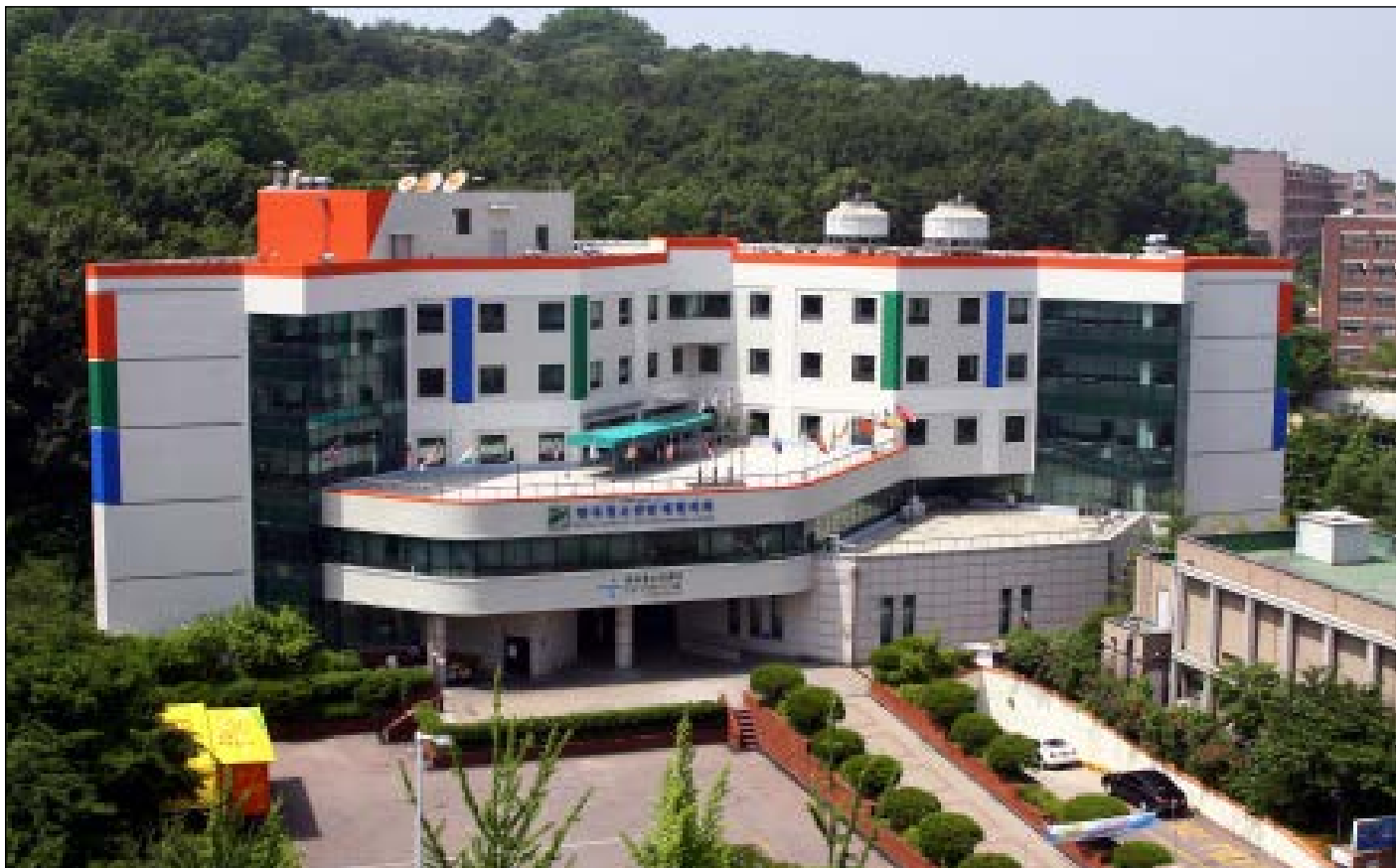
The International Youth Center Youth Hostel is the venue for SICOGA 2018.

Previous conferences have shown it’s an unforgettable experience to be to be part of such an international event where people from so many nationalities, languages and cultures come together from across the world.