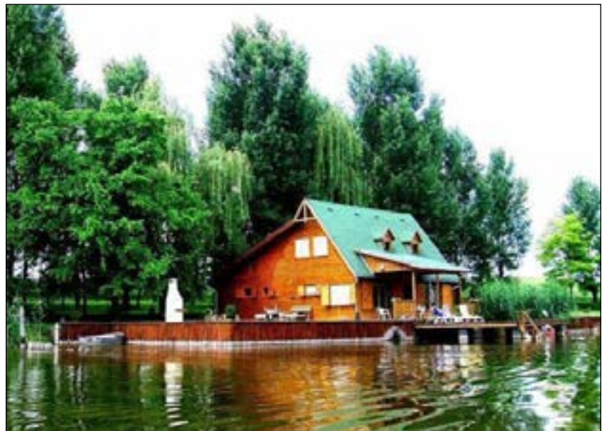
The Servas Youth New Year Party will take place in Nagyhöröcsökpuszta in Hungary from December, 30th to January, 4th 2018.

Please find more information about the event here .