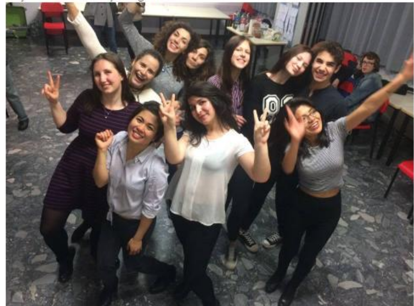
From 20 to 27th august 2017. With the collaboration of Servas Spain Youth , Committee the Servas International Yout For further information and registration form, see here

An example of a posted event on the calendar function on servas.org.