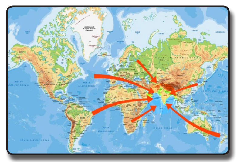
Illustration: Pablo Colangelo, Servas Falkland Islands.

We have discussed our contribution to climate change, realizing that Servas members consume fossil fuels to attend meetings.