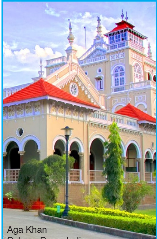
Palace, Pune, India. 100 km. from the SICOGA venue.