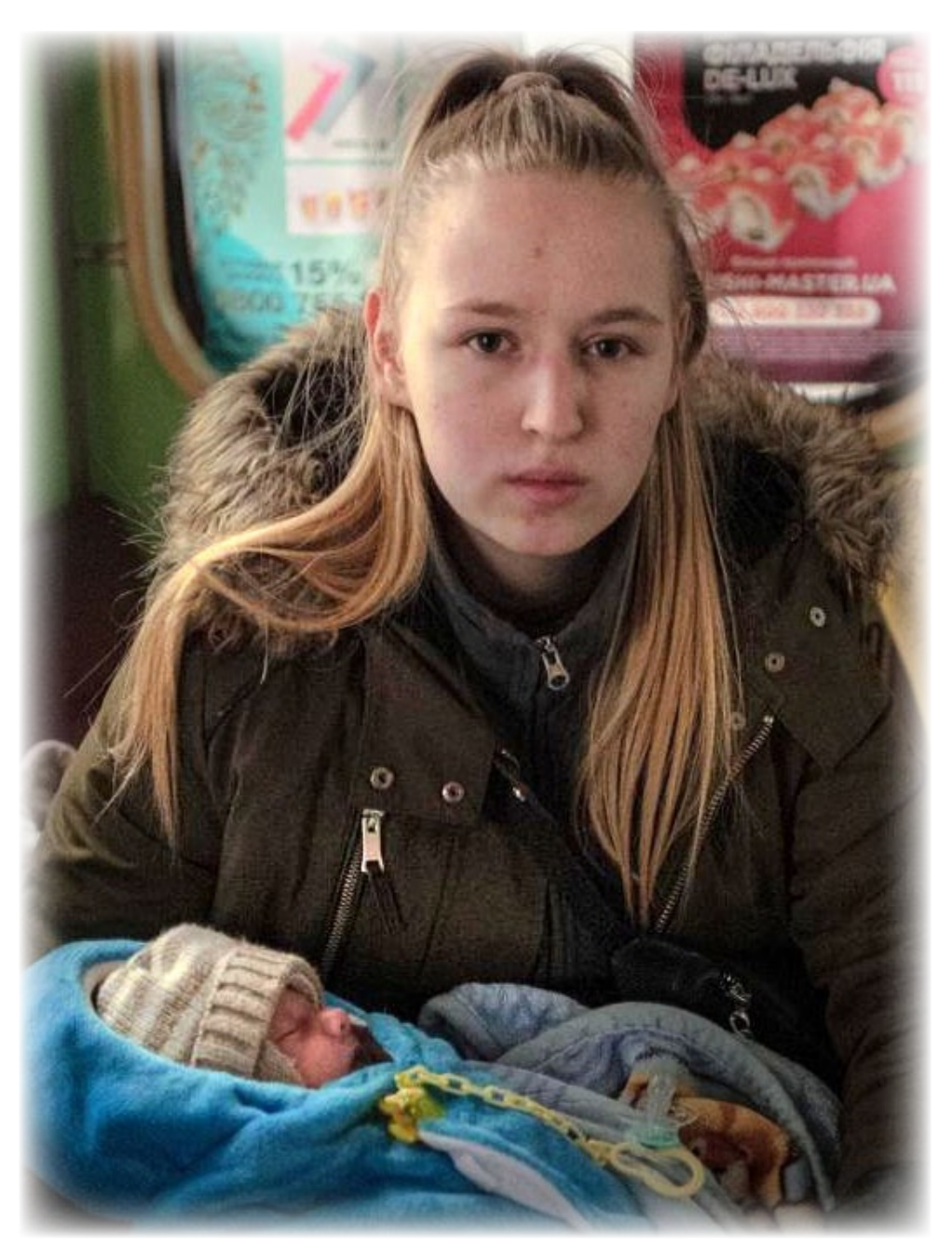
Photo and text from a public website: This 19-year-old Ukrainian mother lives in a train wagon in a subway station with her newborn son.

I believe in common sense and hope that peace will be restored. After all, this is what everyone needs.