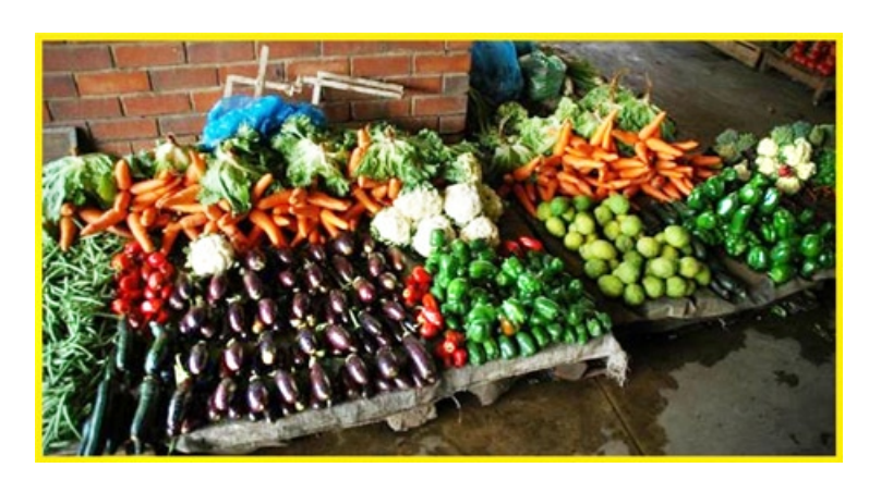
→ Week 4: 1 week of self-funded travel at a lake or around Malawi & back for debriefing with Nat Sec.