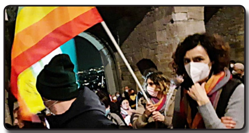
Servas members join peace march in Italy.