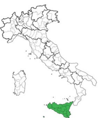
23-29 August 2022

Catania, on the west coast of Sicily near the Mount Etna Volcano.