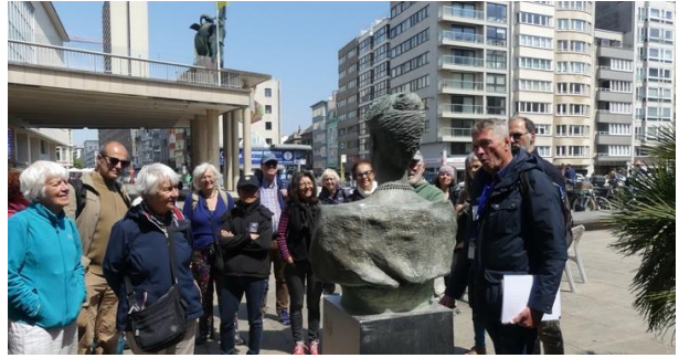
Guided tour through Ostend, here around the bust of Grace of Monaco