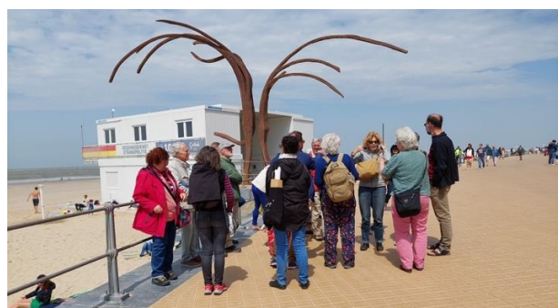
Sculpture Dancing Waves at the start of the town walk

In the afternoon we get a city walking tour. We have to meet at a sculpture called “Dancing Waves”. We stop at, among other places, a bust of Princess Grace of Monaco (Ostend has a city bond with Monaco). The walk ends at the railway station where we have a group picture taken.