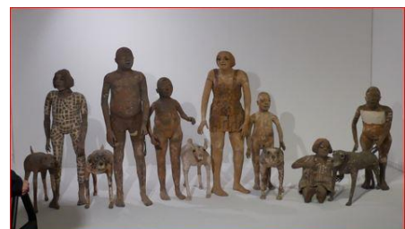
The sculpture group of José Vermeersch in MU.ZEE

The first morning we visit the Mu.ZEE, an appealing museum with literally for everyone his liking. I for instance was intrigued by the sculptural group of José Vermeersch: nine persons and five dogs. They stood in a row and looked like people of centuries ago. Or the painting by Athos Burez of September 2020, “The bathers of Ostend”, in which we see some bathers watching all kinds of other bathers.