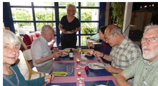
At the table for the potluck

Delicious: we would begin with the potluck. In a comfortable and welcoming social centre, “De Klisse”, with sufficient cooking facilities in Ostend’s “Vredestraat” (Peace Street): could it be more suitable for a Servas meeting? Slowly the Servas guests drop in. All through conversations of ‘happy to see you again’. The dishes they brought along are displayed on tables. And other tables made ready to sit at.