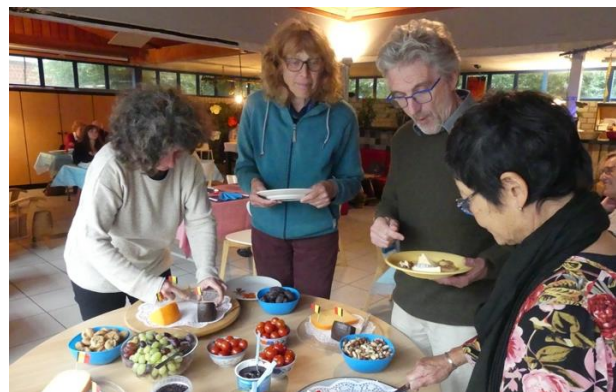
Around the delicatessen at the farewell dinner