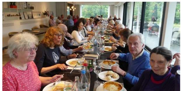
Warm lunch in the Koninginnehof in the Maria Hendrika Park