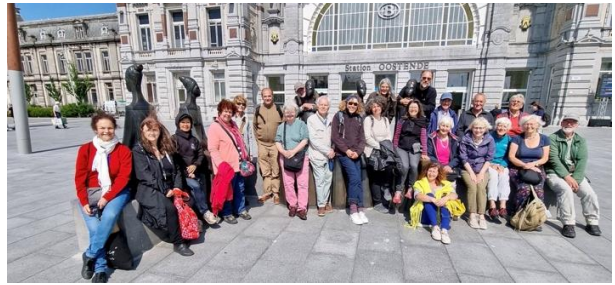
At the Ostend railway station after the town walk

For the evening we visit individual hosts that offer us a cosy dinner and where we can exchange lots of Servas experiences. Our hosts happened to live high up in a flat with a fabulous view from the roof terrace.