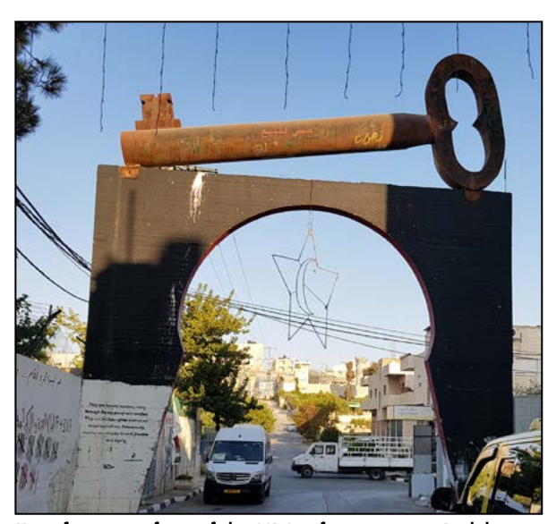
Key of return in front of the AIDA-refugee camp in Betlehem

I didn't expect to meet so many Christian Palestinians. They see themselves as Palestinians — as Palestine is an Arabic country. Actually the number of Christians is decreasing