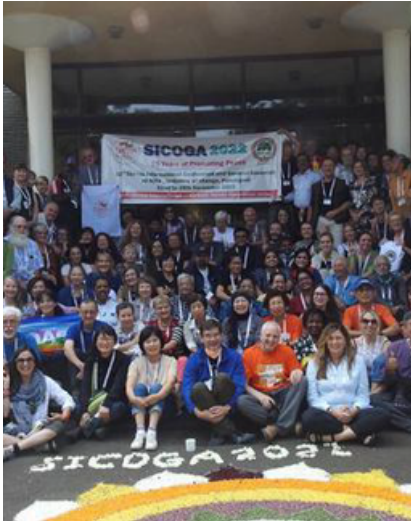
SICOGR 2022: Panchgani in India.

On servas.org you can get insights of what happened during some of these meetings: