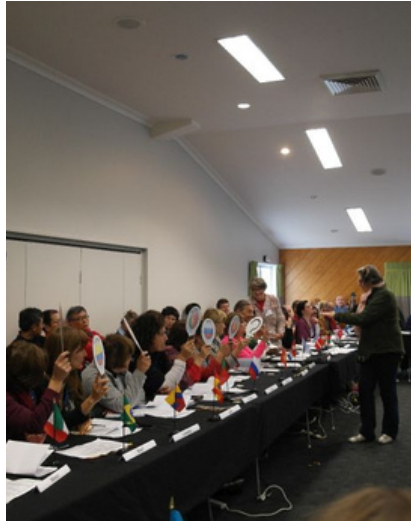
SICOGR 2018: Seoul in South Korea.