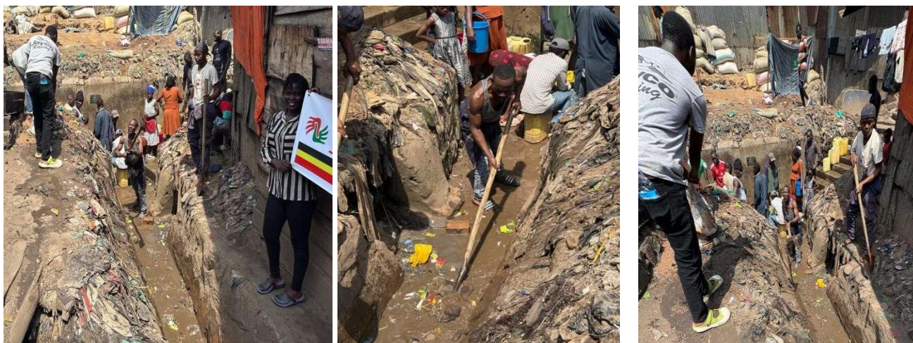
Water well cleaning activity by Servas Uganda participants and community members