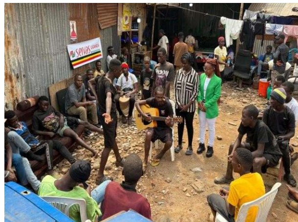
Youth in the slum area of Katwe playing Guitar and singing songs of peace