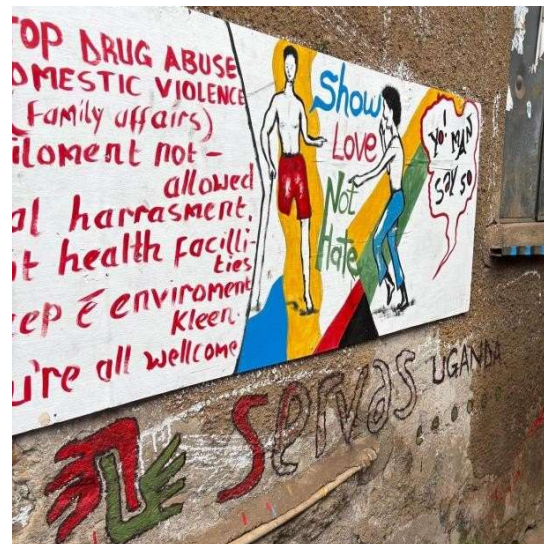
Art painting for peace promotion among runaway youth in slum area