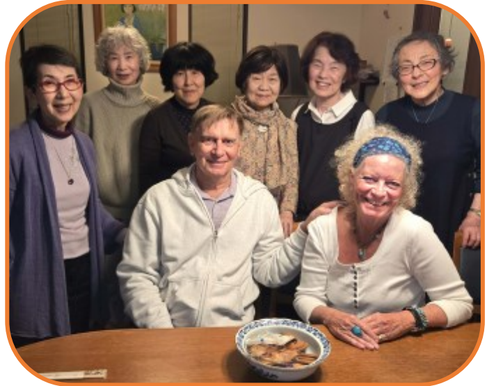
Photo: centre and right: We learned that one can clap at a shrine [orange] but not at a temple [white].

Photo: bottom: Teahouse attendees included our Servas hosts.