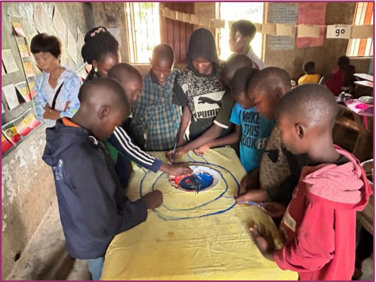
Photo: Children at the Uganda Peace School